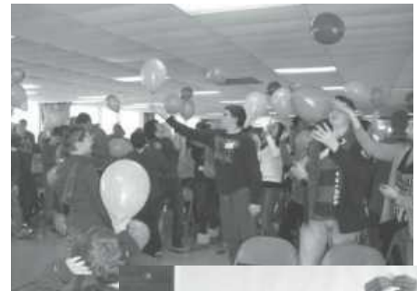
Pictures from the OLPH and St. Joseph Eight Grade Confirmation Retreat Held at St. Joseph, Mantua