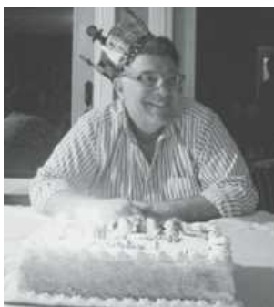
May God bring you many blessings!